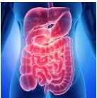
Food and the Digestive system

This project teaches children about life in Britain after the Roman withdrawal. Children will learn about Anglo-Saxon and Viking invasions up to the Norman conquest.